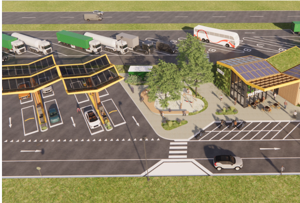
Gentbrugge station render, Belgium