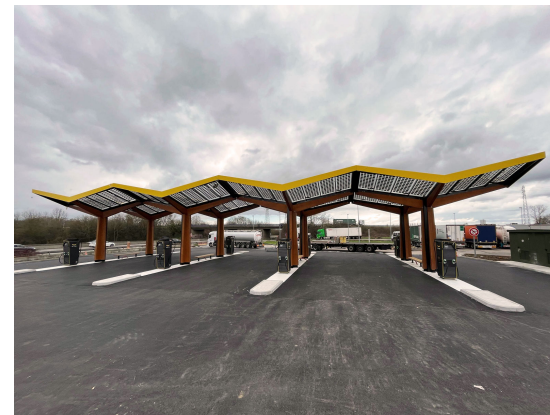
Station La Maxe, France