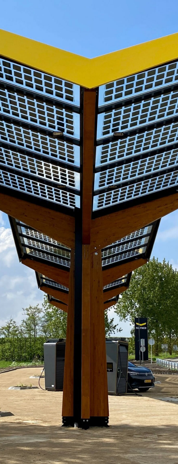
< Station Voetpomp, The Netherlands