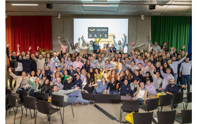
The Fastned team at the Builders' Summit

We always listen to our customers. In May, we launched the Fastned app on Apple CarPlay, which was our customers' most-requested feature. We now provide the safest way to find a charging station while driving, by being visible on cars' screens, which contributes to our great charging experience. With a 4.7/5 rating of the Fastned app (Apple Store), and one of the best Google map ratings in the market (4.5/5), Fastned is recognised as the best charging network by European electric drivers. Additionally, our Net Promoter Score of 53 (Q4 2022) shows that our customers love recommending our stations to their communities.