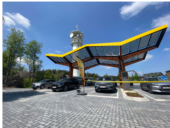
Station Baraque de Fraiture, Belgium