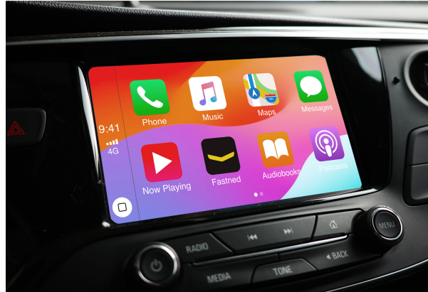
The Fastned app on Apple Carplay

Electric-only service areas will become mainstream in the future. In the Netherlands, we already see that the national government is starting to plan for the phase-out of petrol stations with its new service areas policy proposal, and we can expect that other countries will follow. With the new Gentbrugge stations, we will show that we have the winning concept for zero-emissions service areas.